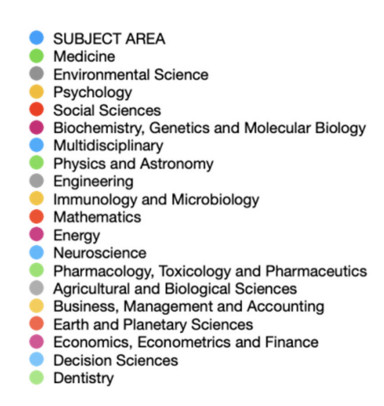
Figure 2: Subject-wise analysis